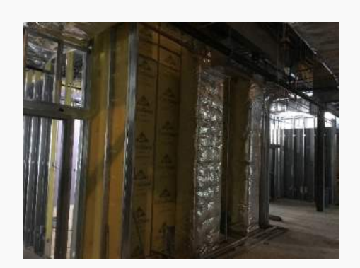
els MEP Shaft Wall