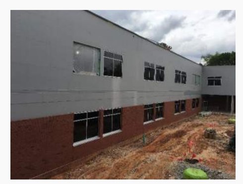
Window Frame & Glass at Courtyard