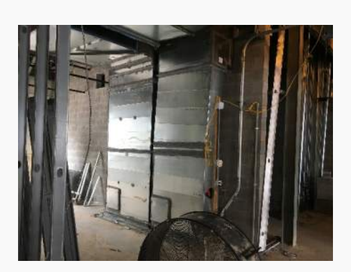
HVAC Floor Penetrations