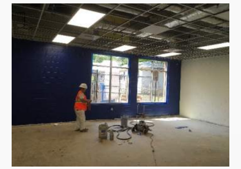
Paint at Classrooms Renovations