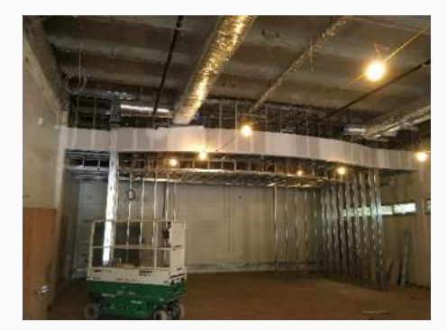
Stage Framing at Auditorium