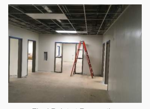
Final Paint at Renovation