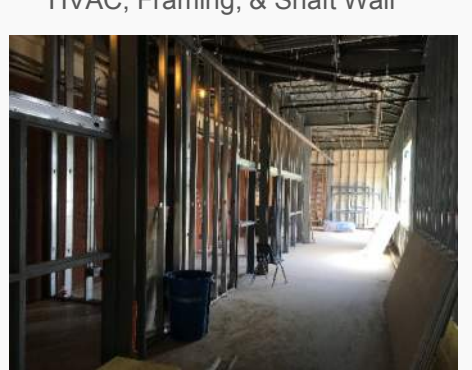
Interior Framing & MEP Rough at Upper Level