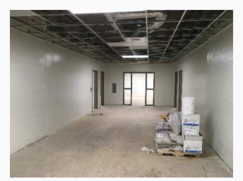
Final Paint at Reno Building