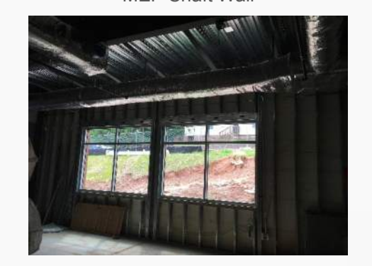
Interior side of Windows