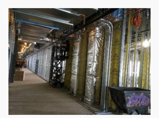
HVAC, Framing, & Shaft Wall